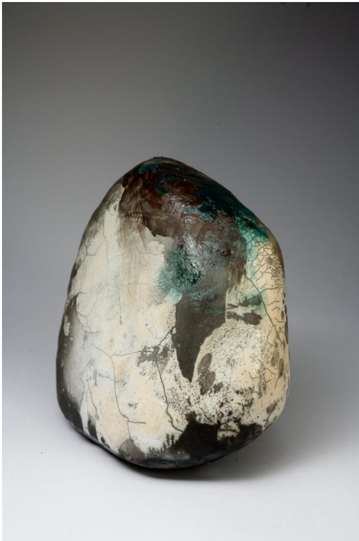
Pietra , 18x13x16 cm, raku ceramic, 2016

Giuseppe Borgia moves between painting, sculpture and installation. He seeks an evocative spiritual grammar linked to the color and the landscape. An ancestral passage on a bridge between the real and the immaterial.