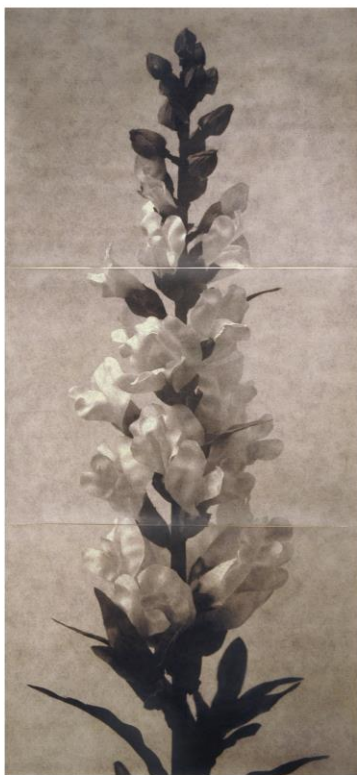
Orquidea III: Gimnadenia Conopea Pigmented inkjet print on Hahnemühle watercolor paper with albumen and varnish 131,1 x 52,3 cm 2006

Through complex installations and photographic series, he explores the boundaries of photography, a media ambiguous by nature, which is not only able to portray and document history but also capable of conditioning it.