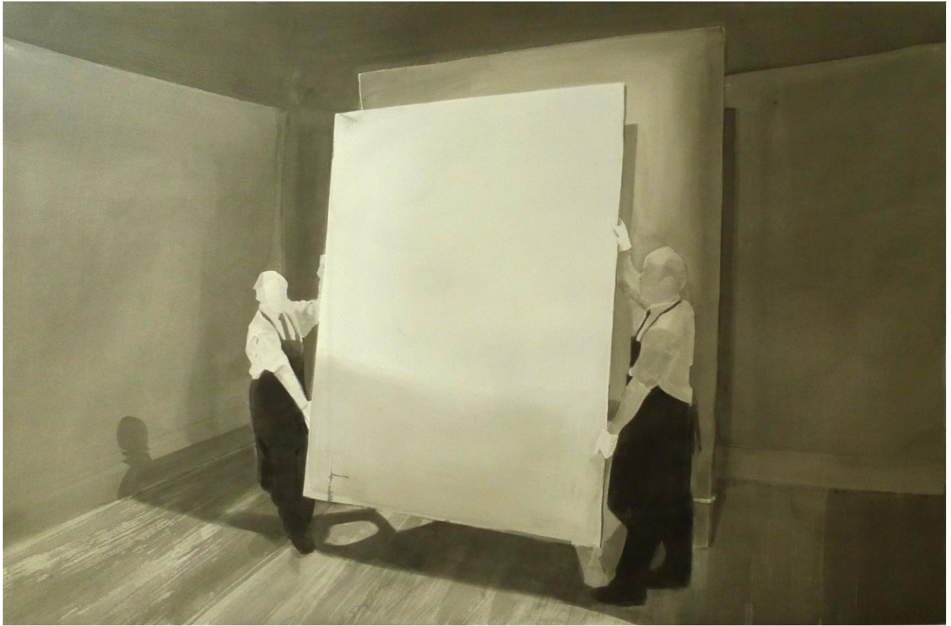
A big picture, 2016, china on paper, 114x 158cm.