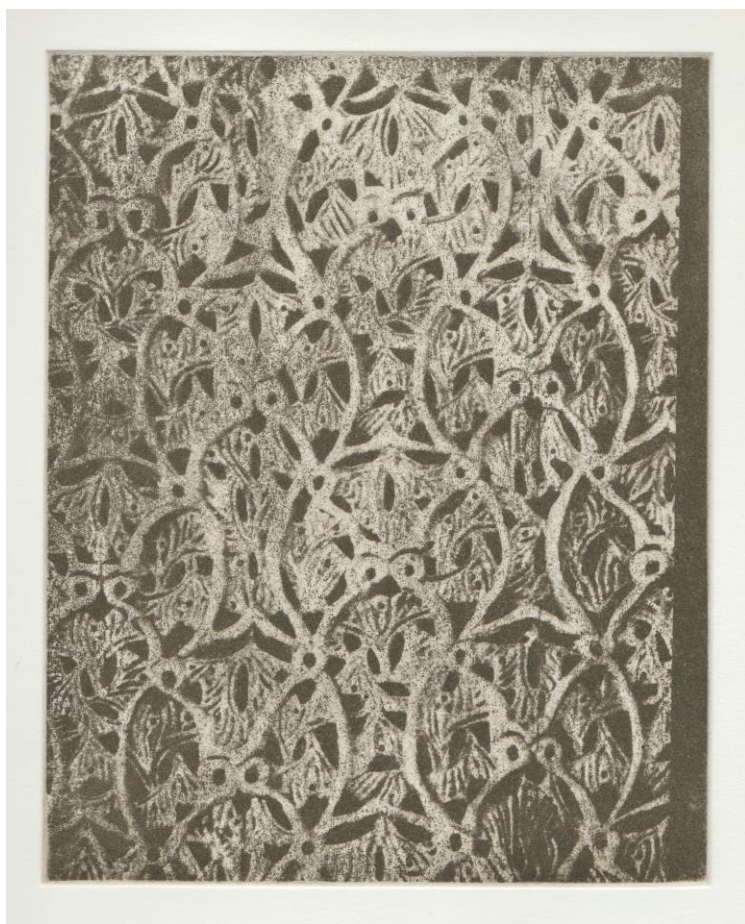
Acquatint on aluminum plate, mm. 200x160

Since 2016 she focused her work on engraving in her print studio, which is located in the heart of Palermo's historical centre, where she's promoting the original print between local artists who are invited in her studio to produce engravings and multiples. In this way her atelier has been transformed into a place where anyone can see and examine tools, machines and etching procedures as well as graphic works from guest artists.